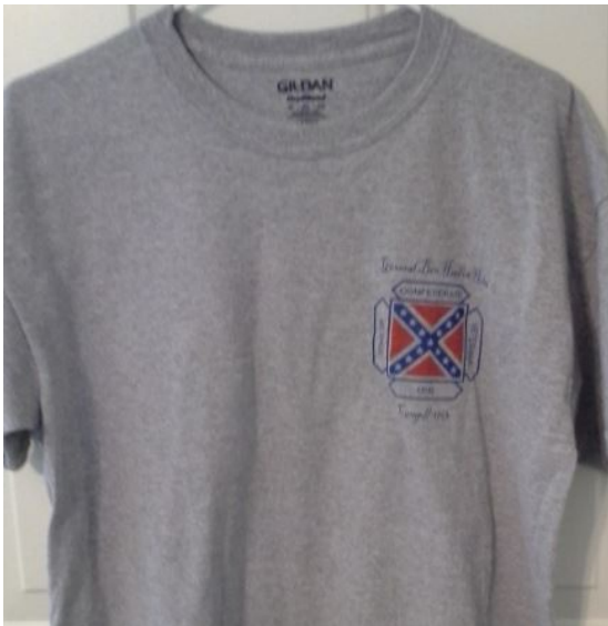
Style 1 ←Front Back→