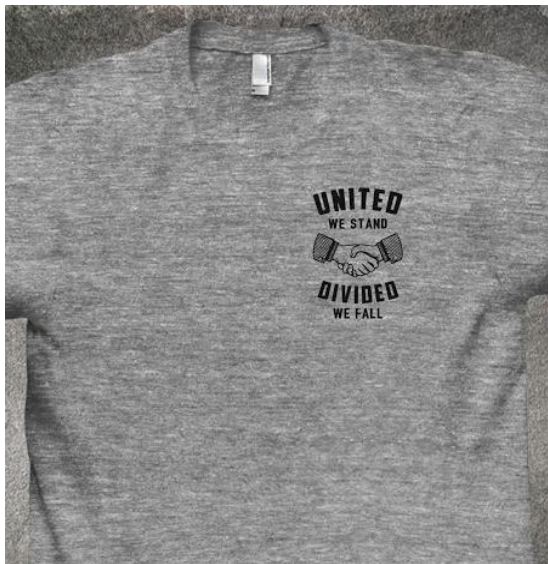
Style 2 ←Front Back→